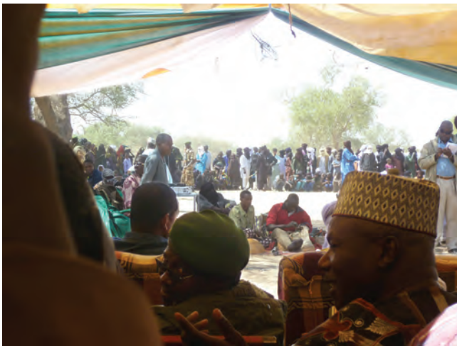
Figure 6. Intercommunity forum in pastoral zone (breeders, customary chief, technical services, local elected officials, farmers associations, local NGOs and development projects)

negotiations and role definitions. Land tenure security relies on a participative process. On the basis of the discourse of the actors and their perceptions of the initiatives and innovations of the projects, our analysis brings to light the impact of these actions in the Dakoro department. This process has enabled the resolution of conflicts concerning access to and control of resources. The pastoral and institutional stakeholders are gradually taking account of social values in the definition of actions concerned with the preservation of territory and the consolidation of peace. In total, there have been 800 km of corridors created by PASEL and 47 pastoral enclaves demarcated out of the 64 existing in the department (Cofodep, 2012) and over 71 intercommunity forums and workshops and 128 committees to monitor transhumance corridor set up.