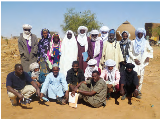
Figure 5: Interview with pastoral group of AREN Bokologi (Dakoro, 2012)

These operations help protect herds against epizootic disease and drought, “but by raising awareness of the AREN and SAREL projects, we train livestock producers to combine crop and livestock farming, namely to preserve millet stalks using chemical treatment, i.e. urea; using 5kg of urea diluted in 100 litres of water, stalks are bundled and sprayed with 100 litres of water before being left to dry in a shaded pit for a week. This product is fed to adult grazing animals rather than suckling animals. Concerning the dose: for the first week the animal is given two thirds what it is used to eating and the one third of the treated stalks which it is not used to eating, for the second week it is given equal parts, in the third week it’s the opposite of the first week. We target animals; the old ones, the studs, oxen used for water withdrawal, gestating females, etc.” (AA 19/12/2011).