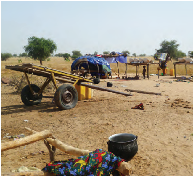
Figure 3. Territorialisation process and marking of pastoral areas by farmers (2012)

Demographic growth and household vulnerability lead to land insecurity for small family farms and increases in land transactions (Lawali, 2011). Droughts and famines modify agricultural and pastoral practices in this part of Niger. Land saturation in the south of the department as a result of population growth (3.5%) and the expansion of the agricultural front towards the pastoral area 20 km north (law 61-5 of 26 May 1961) has led to land-grabbing and land cultivation by sedentary populations. In response to this agricultural encroachment in the area, livestock farmers anarchically create water sources for their herds in order to secure exclusive pastoral land tenure. These actions give rise to local conflicts which are often taken to the highest state level to ministries of agriculture and livestock. Certain dominant groups and politicians fuel these tensions for land and population control to strengthen their electorate in the light of decentralisation. They take over communal resources and impose new access systems and adaptation demands on transhumant livestock farmers (exclusive appropriation of public borewells, concrete wells, monetarised third-party access).