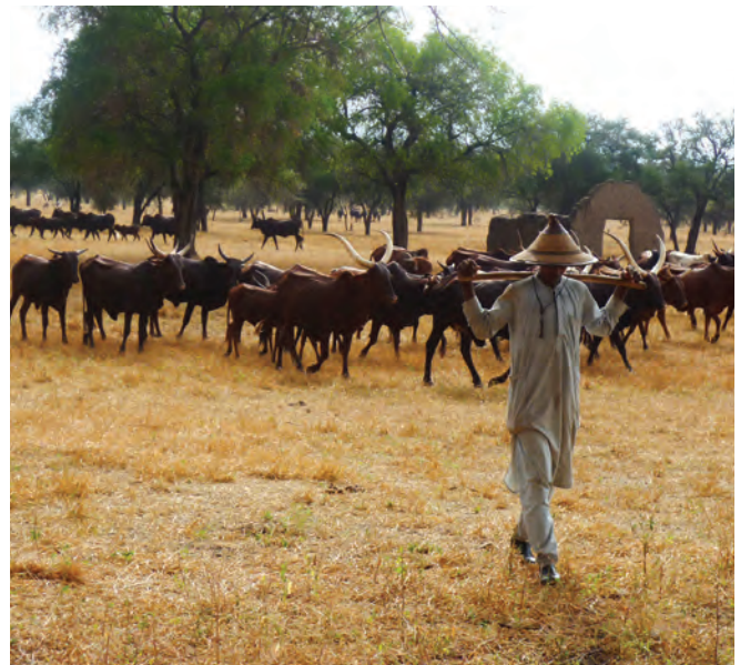
Figure 1: Transhumant herders staying in the Tarka Valley (Dakoro, 2012)

Concerning the animal health aspect of the SAREL project, the aim is to reinforce the defensive capacities of vulnerable households and to protect livestock operations in the region. The emergence of pastoral associations over the last two decades in the sociopolitical arena represents a decisive turning point in the management and prevention of conflicts and use of natural resources. They have imposed themselves as key players alongside other pre-existing institutions in the political arena. They work to justify forms of territorial anchorage and identity claims of pastoral territories. Thus these associations compensate for the disengagement of the state from these socioeconomic issues.